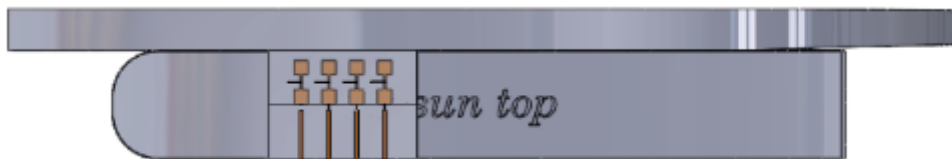
Fig.5. Antenna on Google Glass

When the antenna with parasitic elements is placed on Google Glass, it is important to consider the impact of the device itself on the antenna's performance. One notable effect is the "Google Glass effect," which refers to the influence of the surrounding materials and structures on the resonant frequency of the antenna.